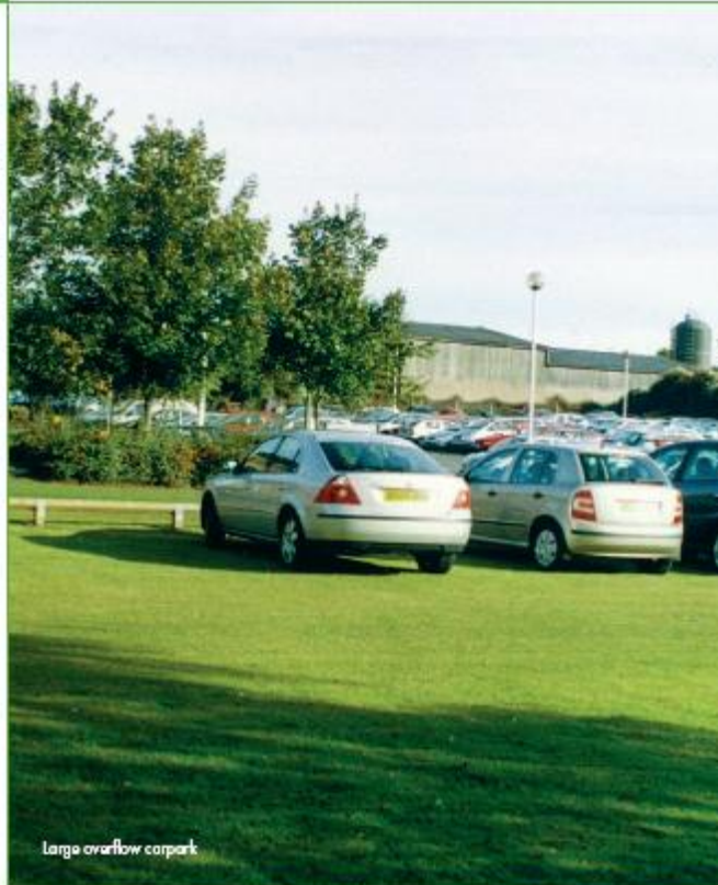
Large overflow carpark

The grid of rings is immensely strong, capable of supporting fire trucks, aeroplanes, helicopters and other heavy low volume traffic.