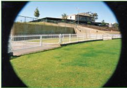
Claremont Showgrounds arena entrances