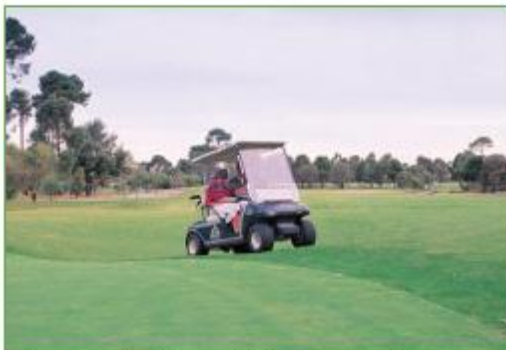
Golf course cart paths and drainage of low lying areas and bunkers