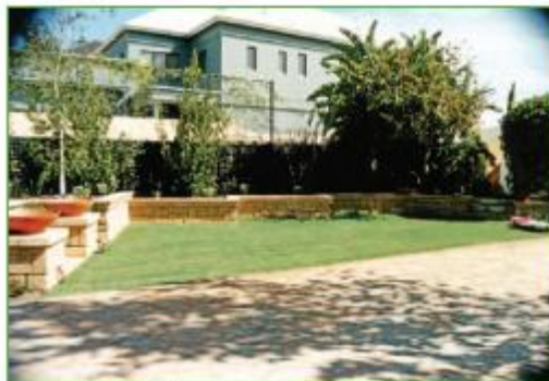
Private resident extra parking