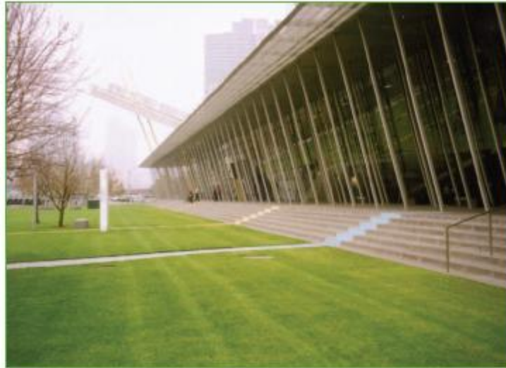
Melbourne Exhibition Centre after completion