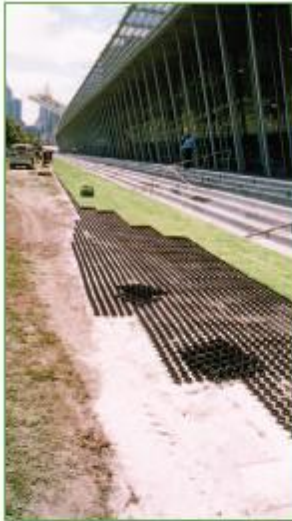
Melbourne Exhibition Centre during installation

Cairns Warehouse: 25 Supply Road, Bentley Park QLD 4869