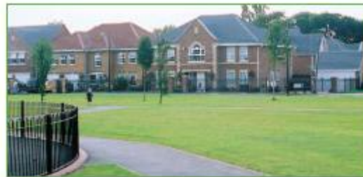
Service vehicle access, across grass to a play area, installed using Grassrings turf reinforcement